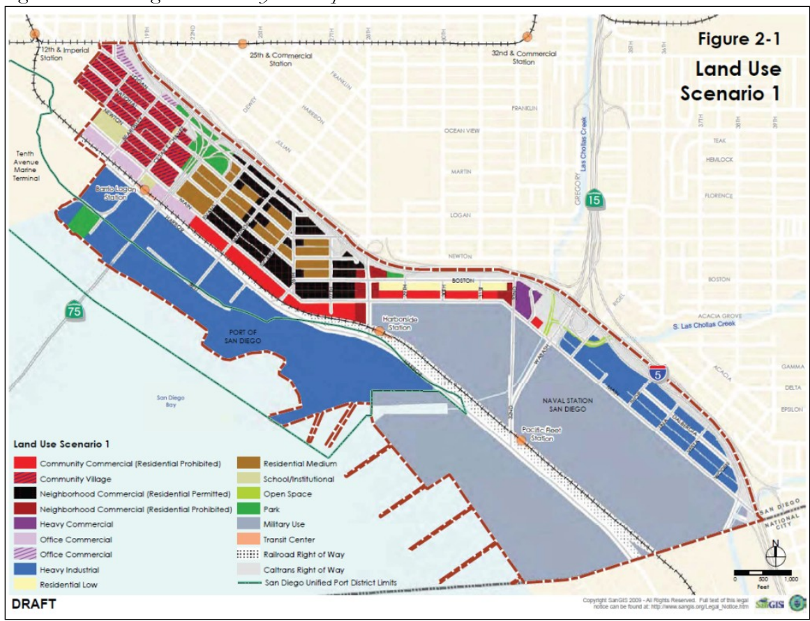
Figure 2: Barrio Logan Community Plan Update Scenario 1

Two separate scenarios were studied under the Environmental Impact Report (EIR). City staff conducted a parcel-by-parcel analysis and recommended the adoption of Scenario 1.