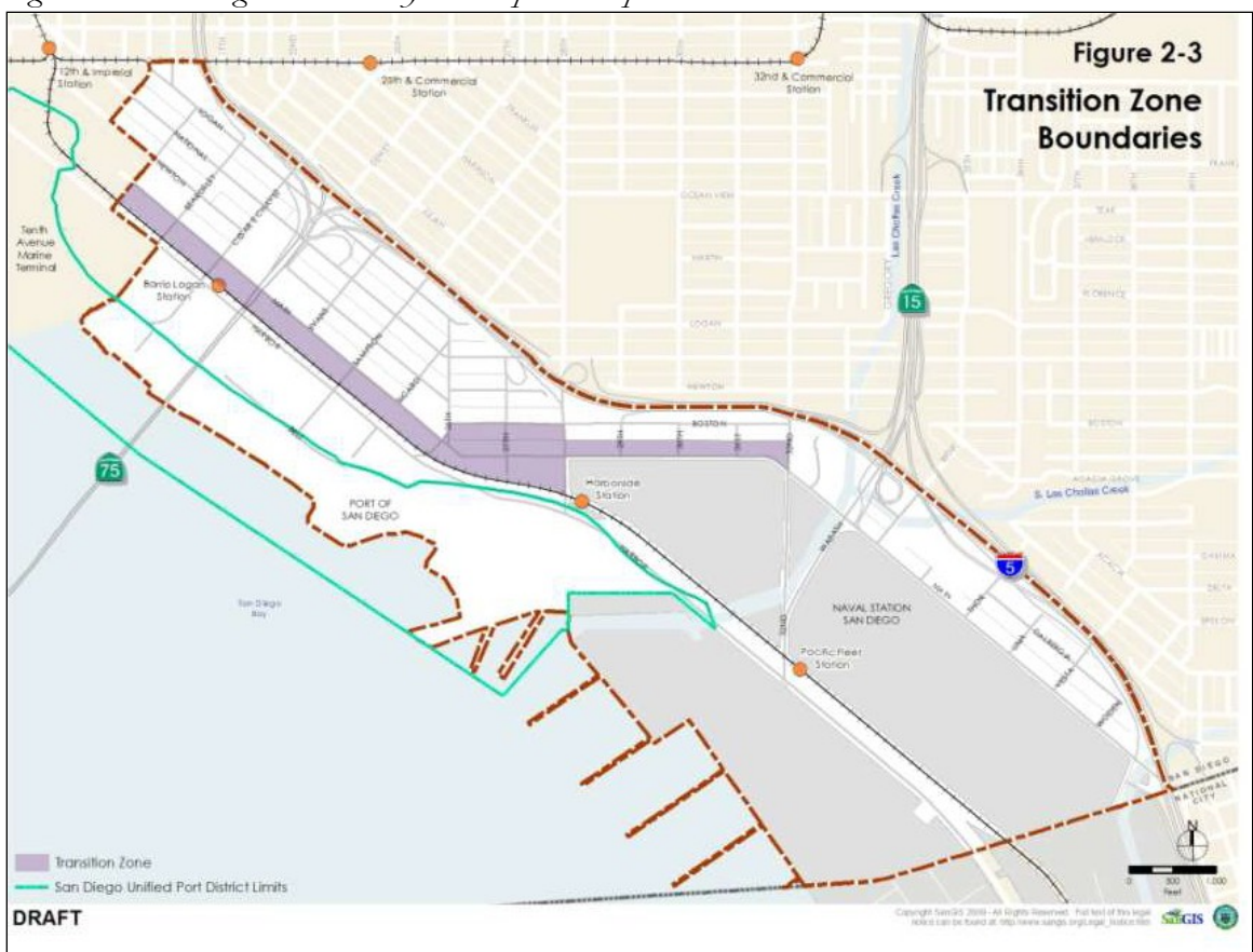
Figure 5: Barrio Logan Community Plan Update Proposed Transition Zone